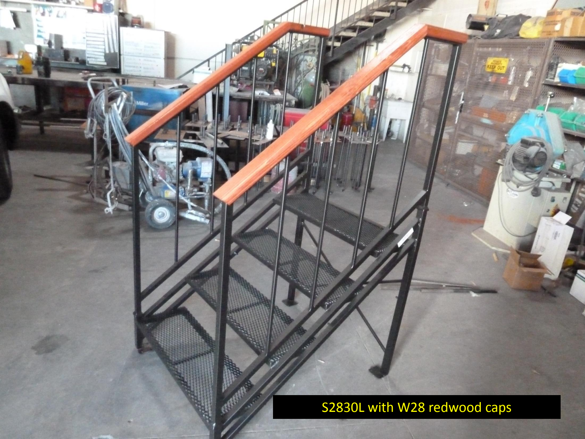
S2830L with W28 redwood caps