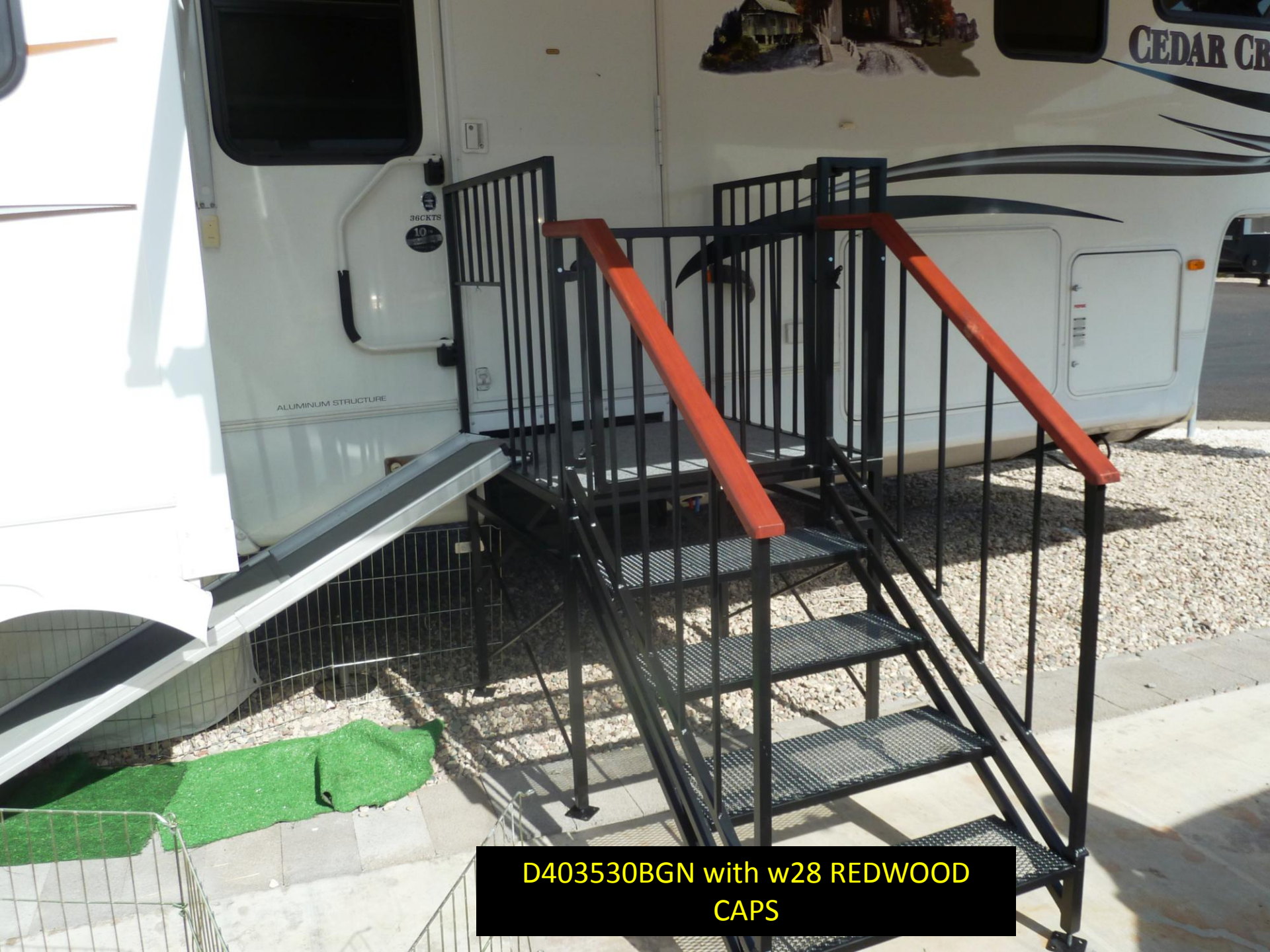
D403530BGN with w28 REDWOOD CAPS