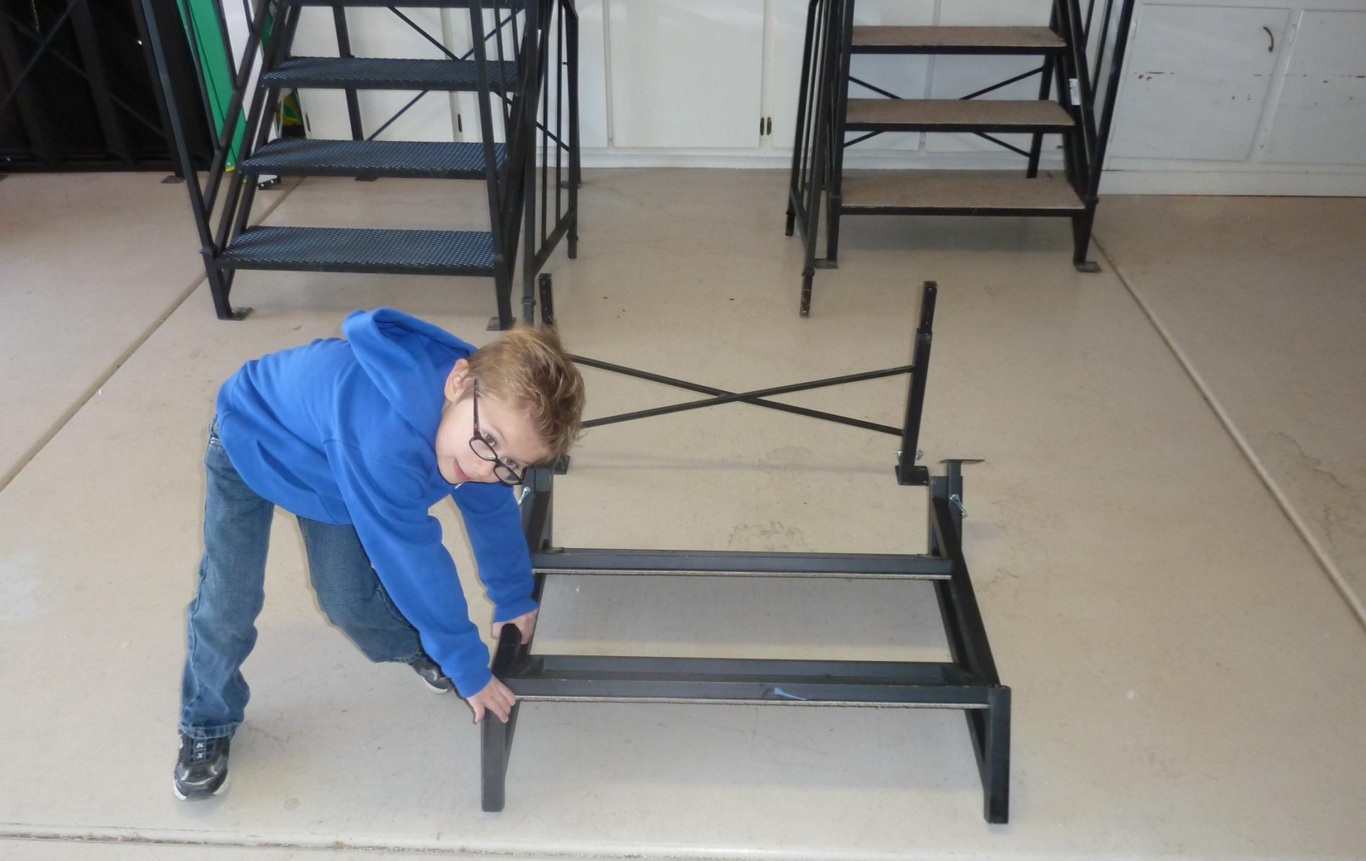
Flip stair assembly over to insert stair legs