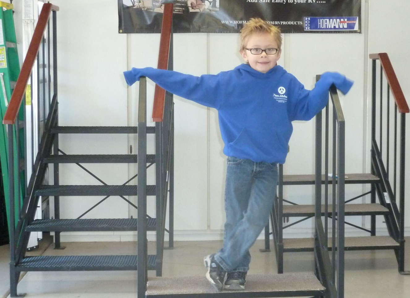
Stairlite Assembly by Chase Hofmann (6 years old)