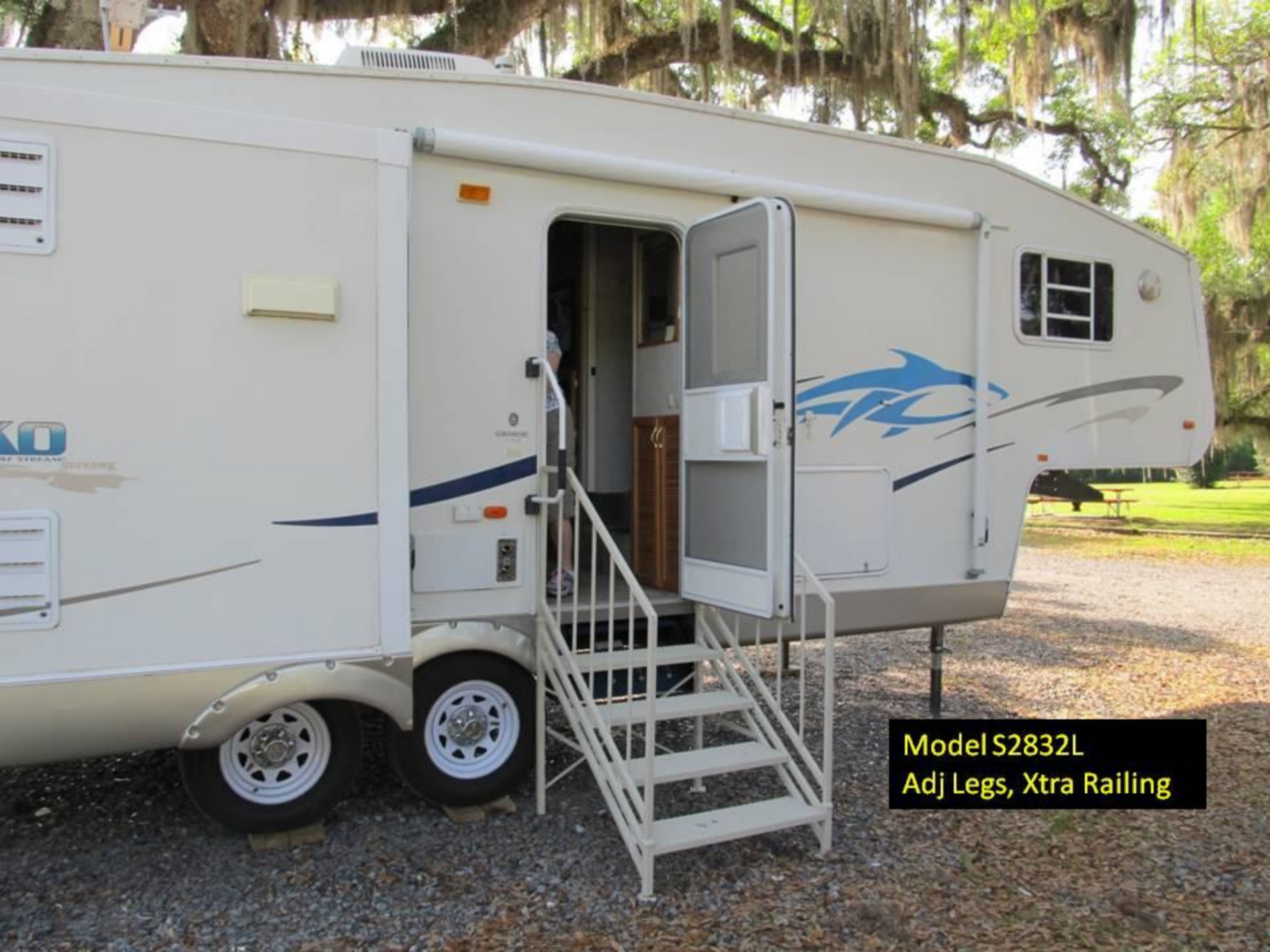
Model S2832L Adj Legs, Xtra Railing